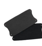
BROWGUARD SWEAT BAND