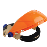
BROWGUARD WITH RATCHET HEADGEAR