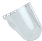
CHINGUARD CLEAR VISOR