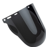
CHINGUARD SMOKE VISOR