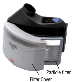
Options For Diverse Environments