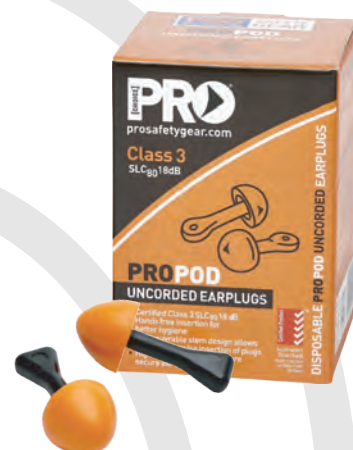
PRODUCT CODE : EPODU

SLC80 Value is 18 (Class 3) Hearing protector Class 3 tested to AS / NZS1270 When selected, used and maintained as specified in AS / NZS1269, this protector may be used in noise up to 100dB (A) assuming an 85dB (A) criterion. A lower criterion may require a higher protector class.