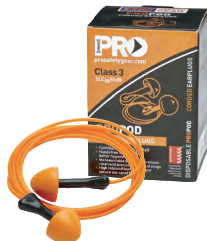
PRODUCT CODE : EPODC